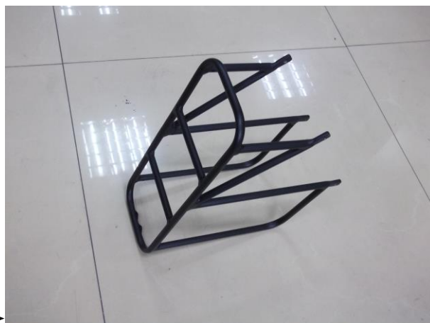
After the test. 测试后→