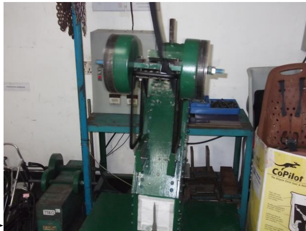
In -testing. 测试中→